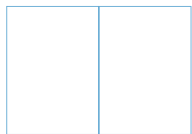
Full Page Spread